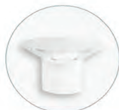
Circular Anal Dilator