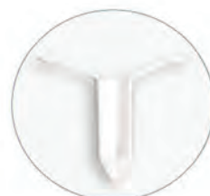
Purse-string Suture Anoscope