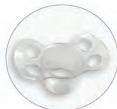
Butterfly Anal Dilator